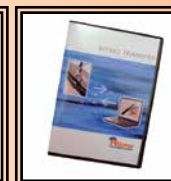
Software Ritmo Transfer