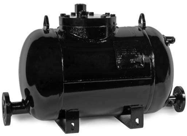
Double Duty® 6