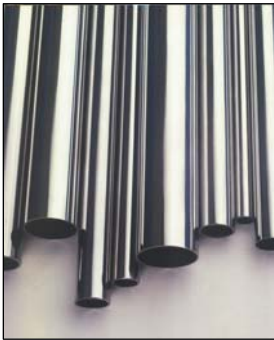
Stainless steel pipes (Welded and Seamless, 316L, 304L, 304, Mat and Polished)

CHRYSsafidis has developed a dedicated STAINLESS STEEL department with specialized engineers, providing integrated solutions at competitive prices for food, beverage, pharmaceutical and other industrial piping systems. We represent quality manufacturers such as INOXPA, ALFA LAVAL and SAUNDERS. Our product range includes: