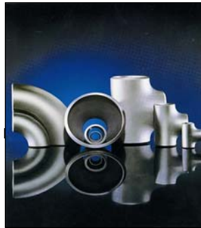
Fittings welded and threaded, (316L, 304L, 304)