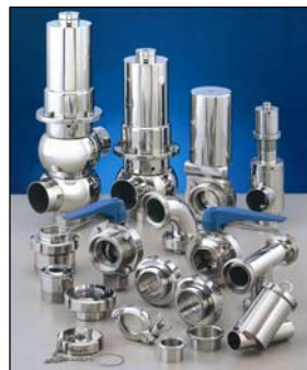
Specialized products for Food, Pharma and Chemical industry