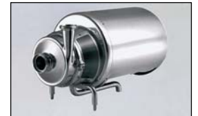
Pumps, Agitators and Blenders ALFA LAVAL - CRANE - INOXPA