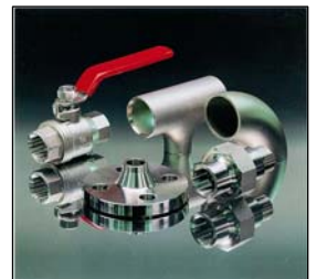
Check valves, Strainers, Safety relief valves, Regulating valves (316L)