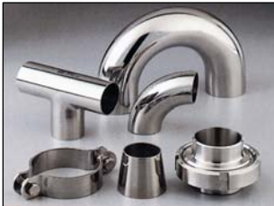
Fittings Polished (Welded, Threaded, Tri-Clamp, 316L, 304L, 304, 316Ti, Ti, Duplex)