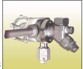
Compact steam-trap stations SPIRAX SARCO