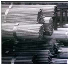
Steel and stainless steel pipes Welded and seamless (API, ANSI)