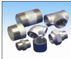
Steel and stainless steel welded fittings (SCH 10, 40, STD, 80 XS)