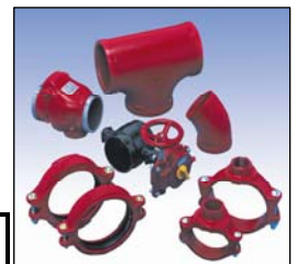
Grooved fittings GRINNELL - RECOMB - ATUSA