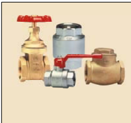
Brass valves CRANE - CIMBERIO - IVR - APM