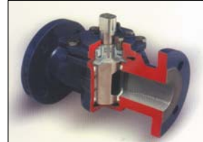
PTFE Lined Plug, Ball and Check Valves FLOWSERVE