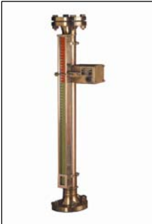
Level gauges - Magnetic level gauges KLINGER