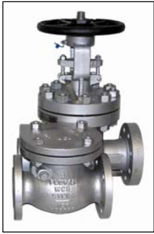
Steel and Stainless Steel Valves of all ANSI classes (Gate, Globe & Check valves) Flanged, threaded & welded FLUVAL

CHRYSsafidis has expanded its activities to include products for the PETROCHEMICAL industry. It has undertaken the distribution of FLUVAL products and increased the range of available products according to American standards (ANSI, ASA, ASTM, etc). Our product range includes: