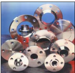
Flanges ANSI - Class 150, 300 600 & DIN