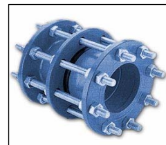
Dismantling pieces GEMAK