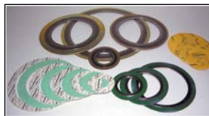
Gaskets - Asbestos free - Spiral wound KLINGER